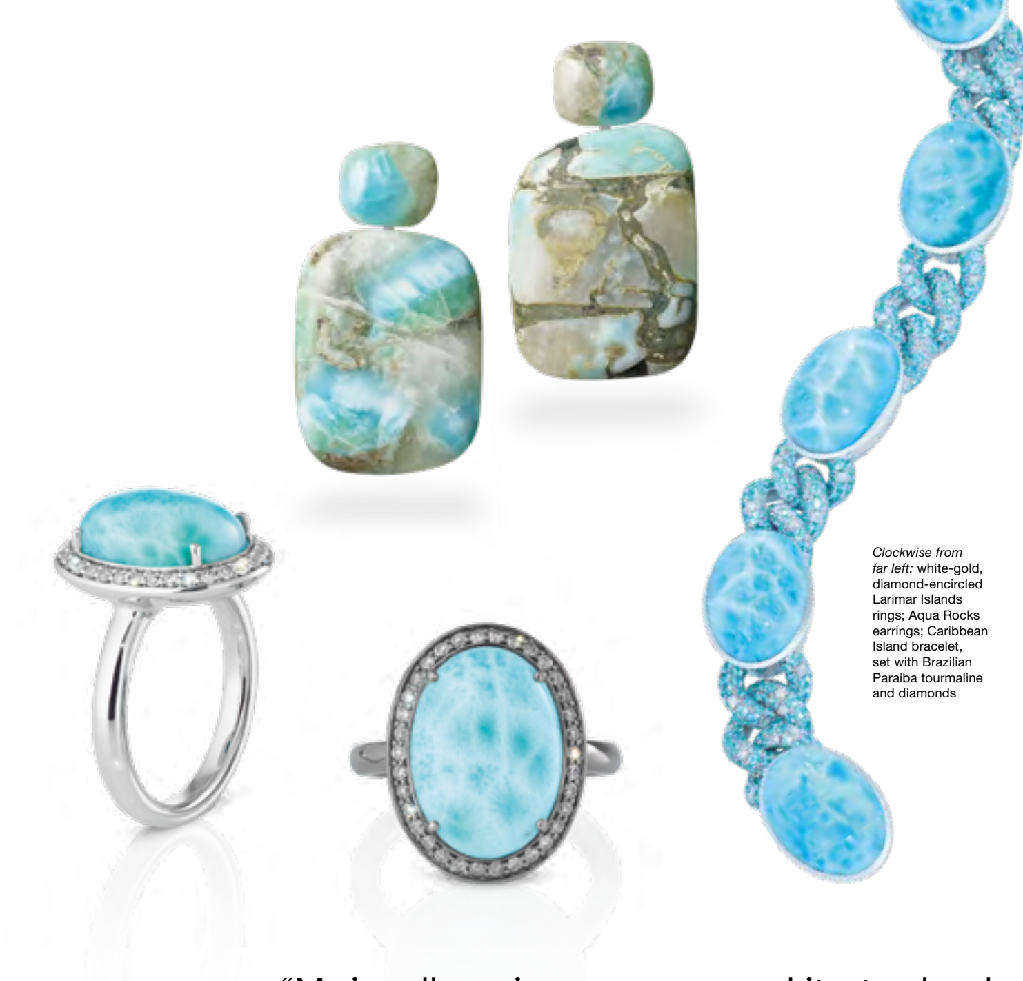
"My jewellery pieces are pure, architectural and timeless. Their geometric and yet organic shapes are meant to enhance women's natural beauty"

- Jirgens remains very much intrigued "Every single one of them has a different vibration," he says. "This aspect resides in each of my jewellery pieces." However, it's not exactly their energy or supposed lifecreations so distinctive and desirable. "My