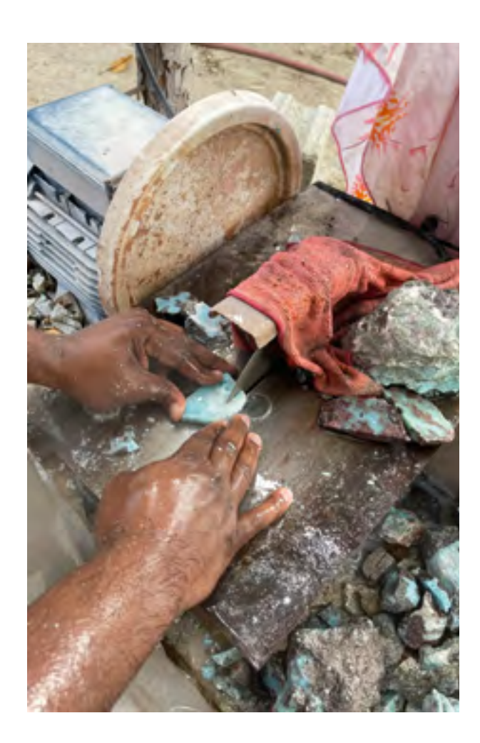
Left and below: measuring and cutting raw larimar on Hispaniola; below right: a rare red-tinted larimar stone that Jirgens is turning